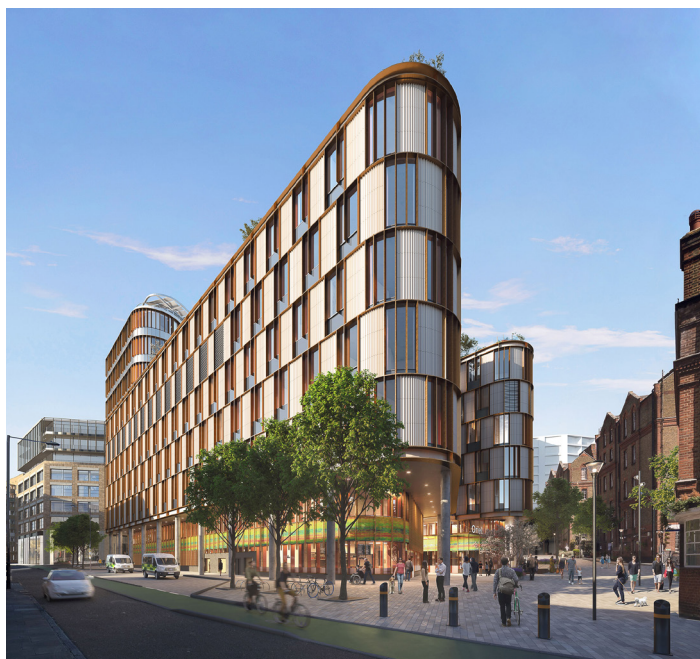
Indicative image of new centre looking north on St Pancras Way.

This is our second newsletter to update you and seek your views on our plans for a new, world-leading integrated eye care, research and education centre on the St Pancras Hospital site in Camden.