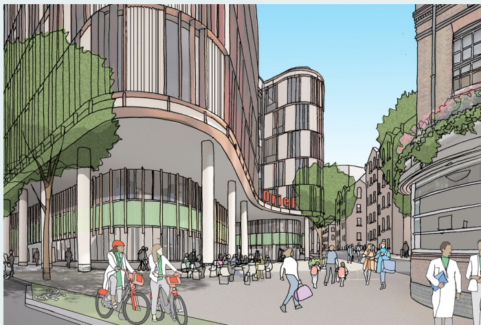
Indicative artist's impression looking east from St Pancras Way, showing the lower entrance and pedestrian route through the site.