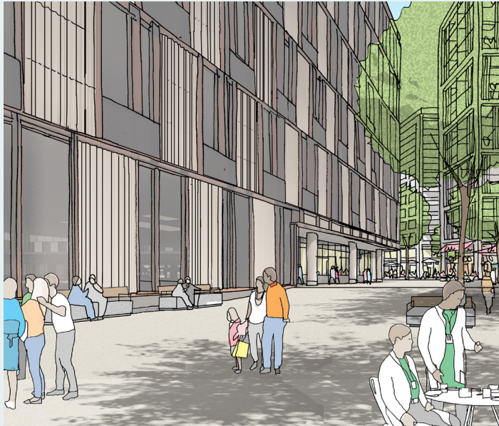
Indicative artist's impression looking north towards the northeast entrance.

Proposals for the remaining three acres of the St Pancras Hospital site are being brought forward by Camden and Islington NHS Foundation Trust's development partner, King's Cross Central Limited Partnership (KCCLP). KCCLP is still at a very early stage of design for their development but, we are already working closely with them to ensure the whole area is developed seamlessly and becomes a genuinely open, accessible, and positive contribution to the neighbourhood.