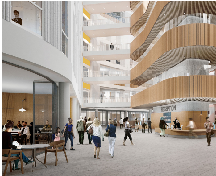
Indicative image of the proposed atrium.

We are looking at levels of lighting, acoustics, temperature and wayfinding both inside and outside the new building. This is to make sure that the new building is accessible and supports the health and wellbeing of our users as well as aiding navigation. For more information visit our website oriel-london.org.uk .